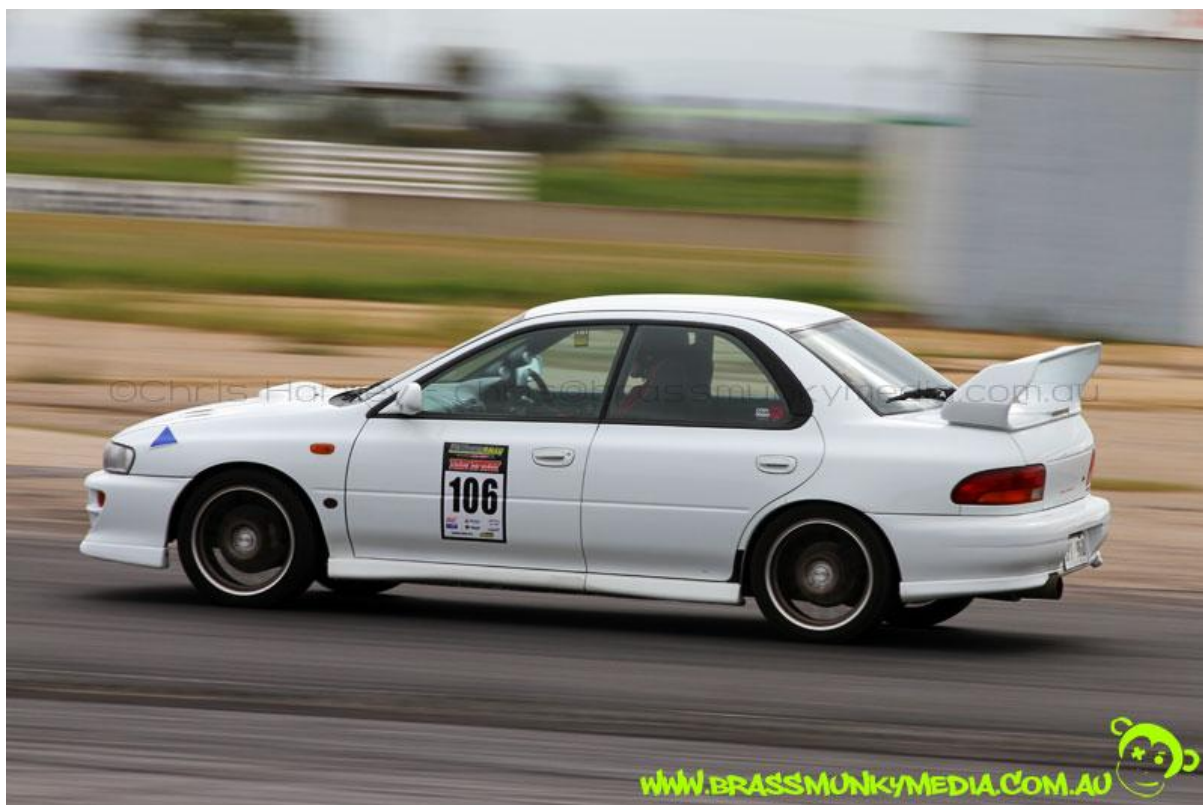
Phillcom Rally Time Attack Round 3 @ Mallala 2010