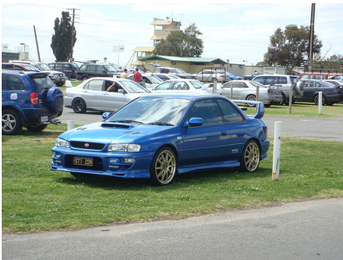
Phillcom Rally Time Attack Round 3 @ Mallala 2010