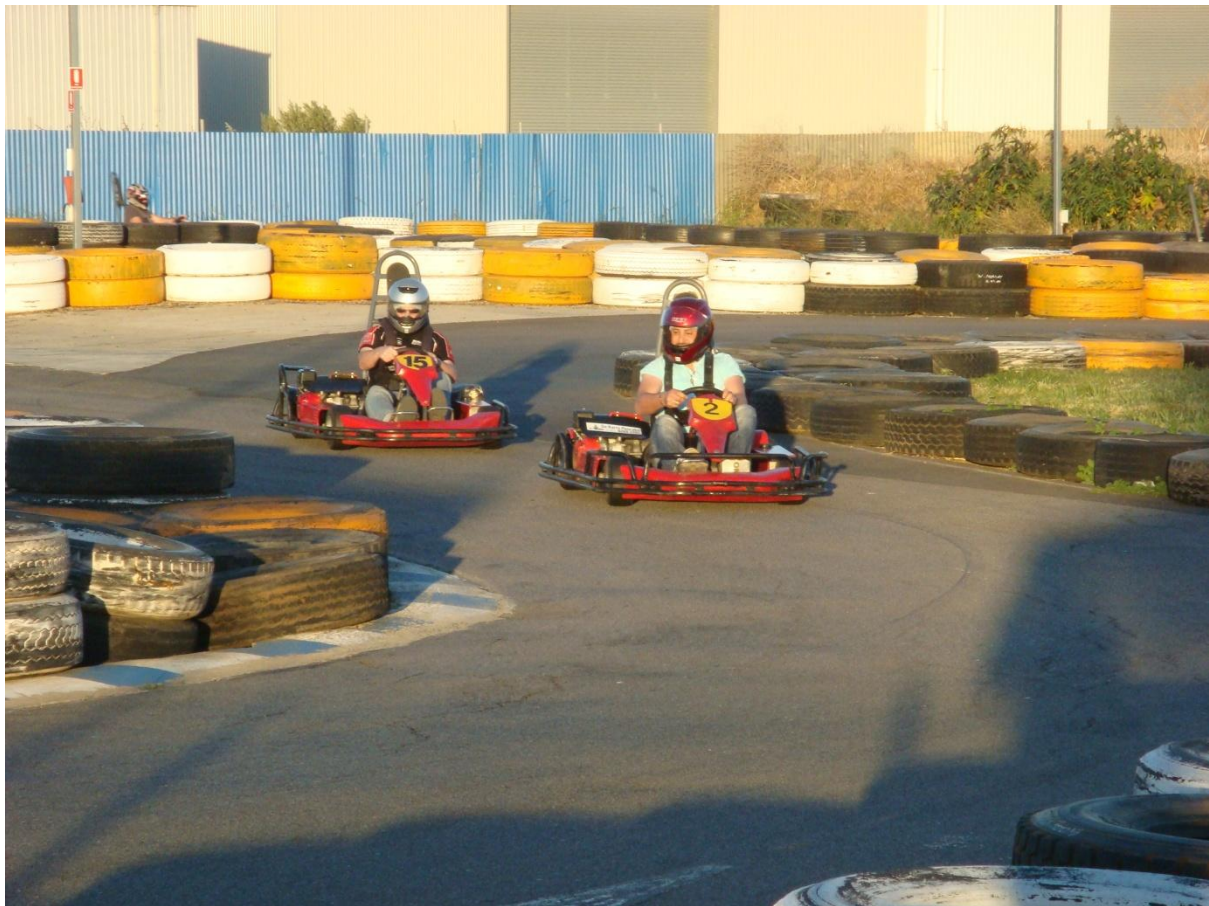
Multi Club Go Karting @ Pooraka November 2010

Want to stay up-to-date with coming events? Why not join us on Facebook, just search for teamsooby.com